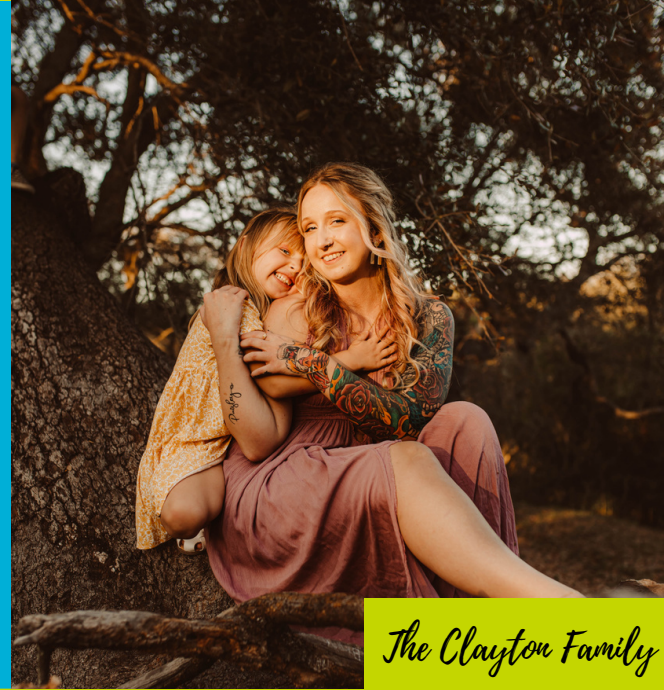
The Clayton Family

donate today at habitatpwp.org/800thhome .